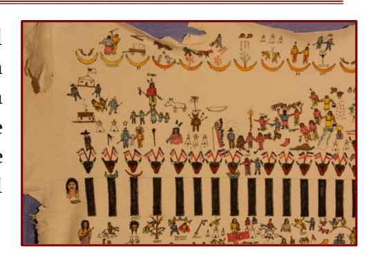
Onco Sai-Guat Calendar

At home, we would get our own shows. Grandpa would roll out a deerskin calendar. I remember it was wrapped in a once-white sheet, now near brown with age. I would watch carefully as the Calendar was being unrolled. The hair of the long-dead deer was always what I glimpsed first, then as the hide revealed itself, primitive figures and bright colors danced across the cured leather's inside.